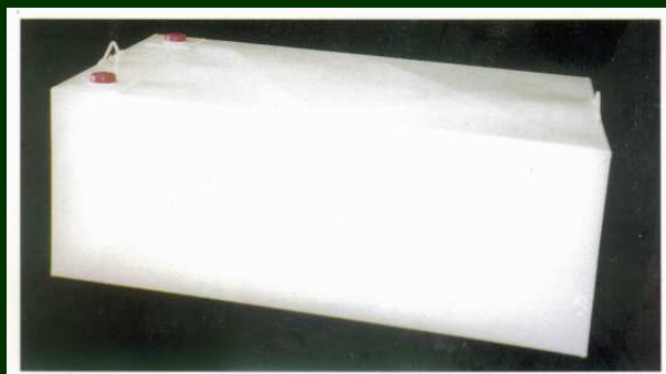
Model 200 PI

This pickup auxiliary tank gives you just enough extra fuel for those long trips. Available in white, black or red. (61" long, 19" high, 11" deep)