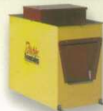
3 Combination 16769