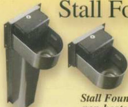
Stall Fount 125 heated 18082