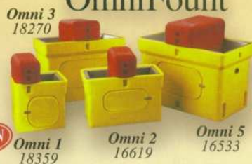
Omni 3 18270